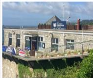
Single Box Ad