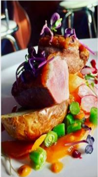
Sky Scaper Ad